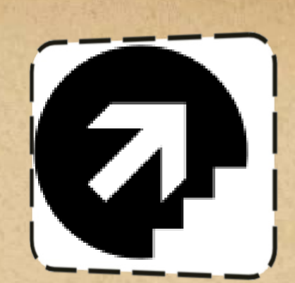
Figure this one out and find the next lette Write it down here----

First go here if you dare the entire team must slide down look for letter write the letter here----