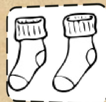
Something that rhymes with socks.