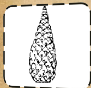
A pine cone