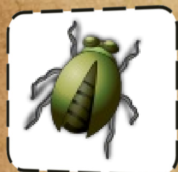
An insect that is NOT an ant