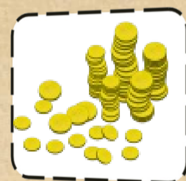
GOLD COINS; CLUE MIGHT HAVE TO SEARCH IN A BIG BALE