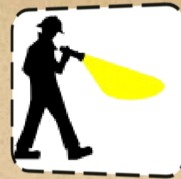
Figure out the puzzle code to find your next location. Go there and find the place of your next location be careful

Go to a place where you can run around and slide. Find three same words and hand them to the tutor.