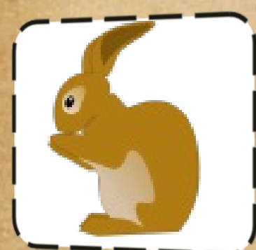
Find something a rabbit would eat