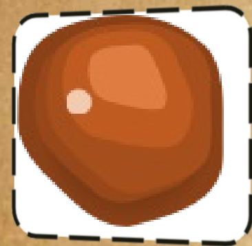
A smooth stone