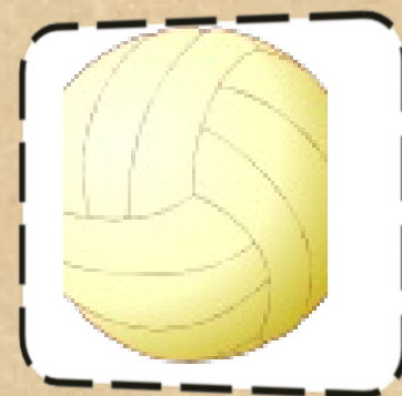
A STRANGERS VOLLEYBALL (EXTRA POINT IF OWNER IS HOLDING IT)