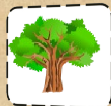
A PIECE OF TREE BARK