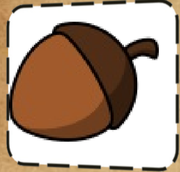
ACORN OR PINECONE