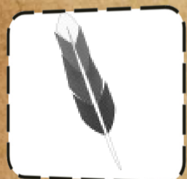
A FEATHER OR SOMETHING FUZZY