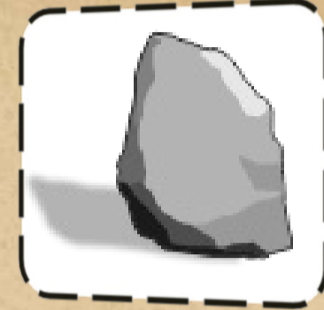
A BEAUTIFUL ROCK