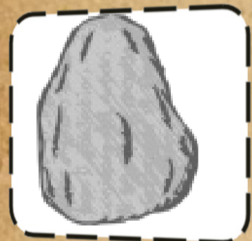
A FLAT SKIPPING STONE