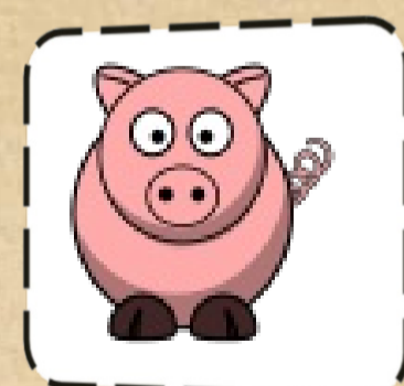
A HAND FULL OF PIG FOOD