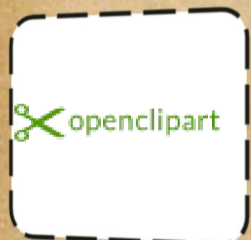
A WILD FLOWER