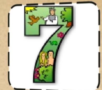
Numbers in Nature