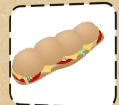
A Military Ship that traveled underwater