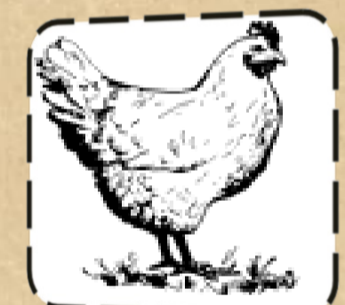
A huddle of hot "chicks"