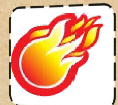
An energy that "burns"