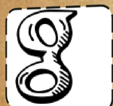
*Copy all scavenger hunt pictures to the Science FT Google Drive