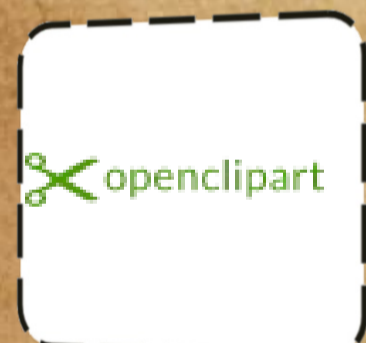
*Send great pictures to Twitter: #ELLScienceFT2015