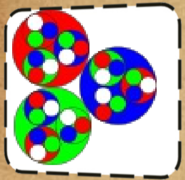
(1) un cercle