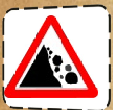
(9) neuf roches