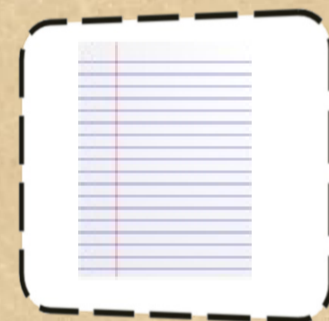
(6) six papiers