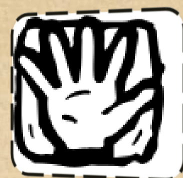
(10) dix doigts