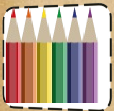
(5) cinq crayons