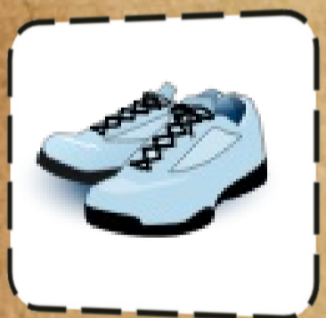
(7) sept souliers