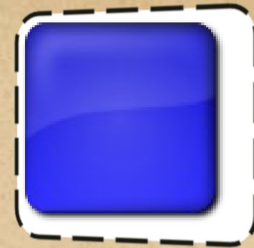
(2) deux carrés