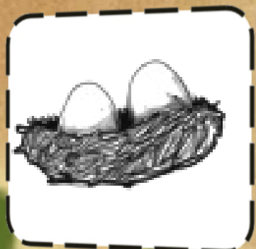
The location of a birds nest.