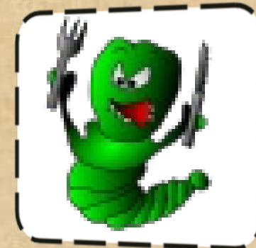
A chewed leaf.