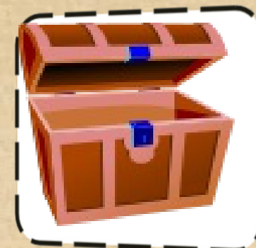
Something you think is a treasure!