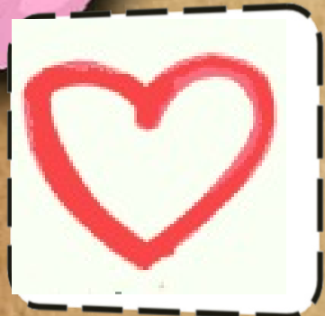
Something shaped like a heart.