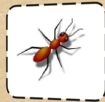
Ant or bug