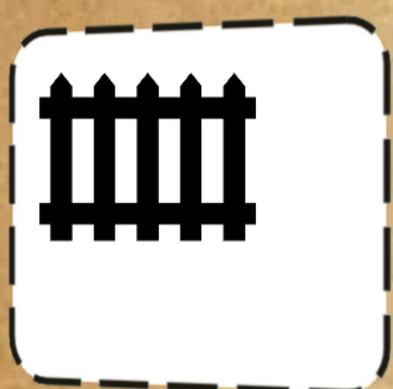
The word "AMERICAN"