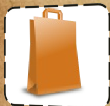
1 Paper Bag