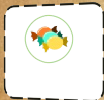
3 Candies or Sweets