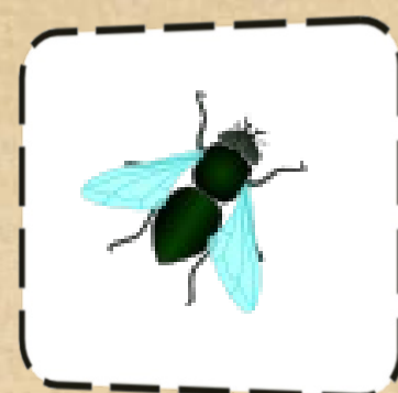
A FLYING INSECT