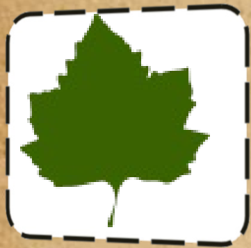
A GREEN LEAF