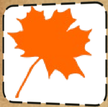
A BROWN LEAF