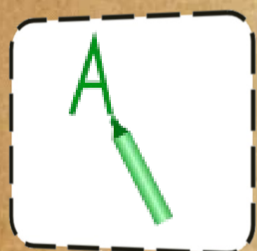
A green pen