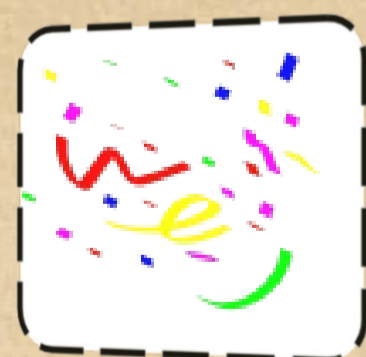
A Christmas cracker joke