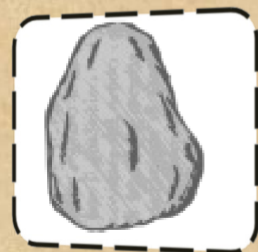
An interestingly shaped stone