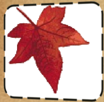
A red leaf