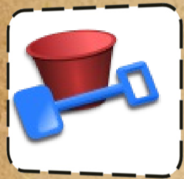
BUCKET and SHOVEL