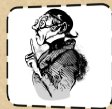
PHOTO: Person with the biggest shoe size must take a photo of entire team with an STL teacher who has been here for 10 years.

Find: A brick on the athletic field entrance with the name of an STL school administrator or teacher all members of the group must take a photo of it.