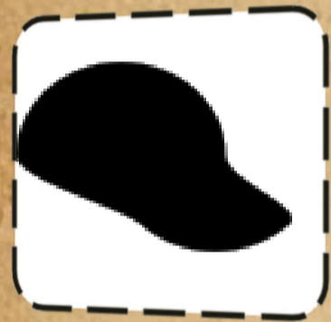
PHOTO: Youngest member must Take a photo of a team member and a teacher/ staff member both wearing an STL hat.

Find: 3 images of the STL Leadership logo and take photos with all team members.