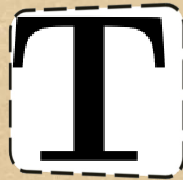
SOMETHING THAT STARTS WITH THE LETTER T