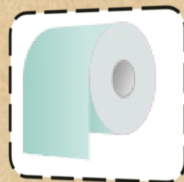
PIECE OF TOILET PAPER