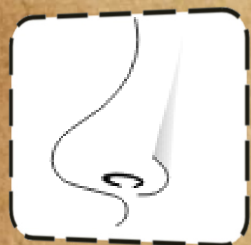
SOMETHING THAT SMELLS GOOD