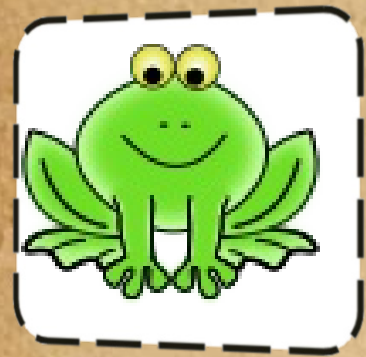
BOOK WITH A FROG