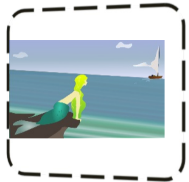
find the mermaid