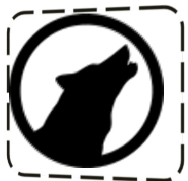
find the gray wolf