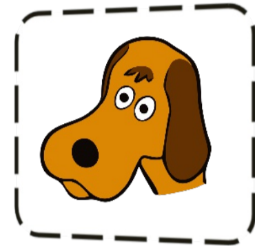
find the stuffed dog