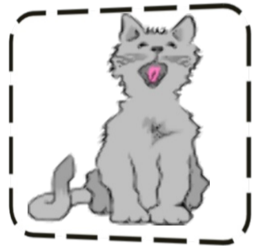
find the stuffed cat