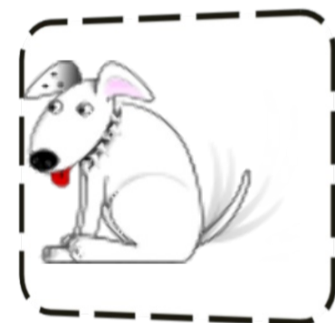
find the white dog