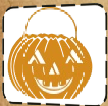
JACK O LANTERN BUBBLES