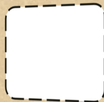
KIT KAT BAR(CANDY)