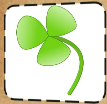
three leaf clover