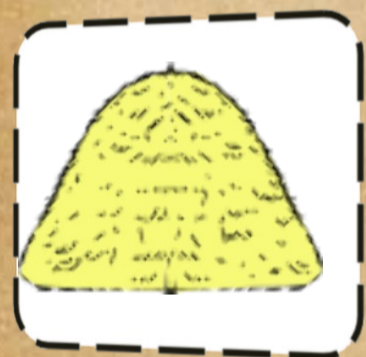
straw or hay