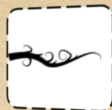
a stick shaped like a letter