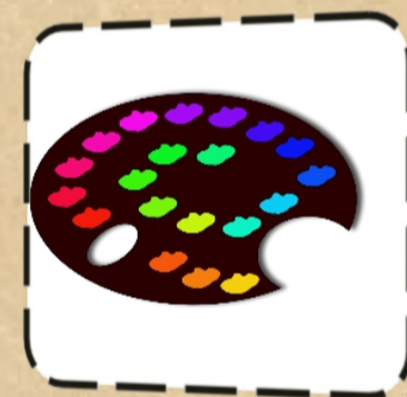
something with four different colours