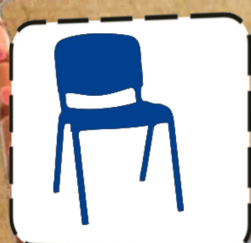
Patient Waiting Room