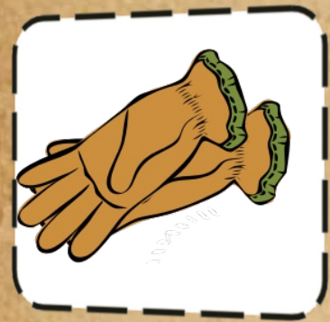
1 pair of Rubber Gloves