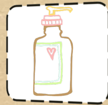
Bottle of Lotion