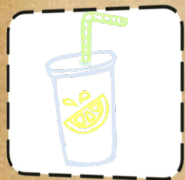
Water with fruit in it