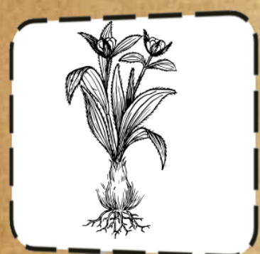
A flower arrangement/plant