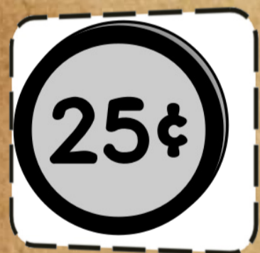
QUARTER FROM 1997