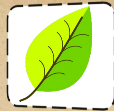
LARGE GREEN LEAF