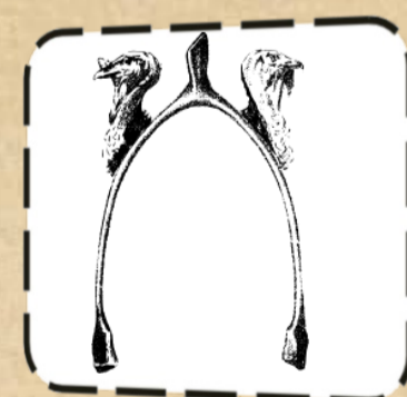
BRANCH IN THE SHAPE OF A WISHBONE