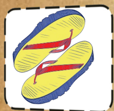
4 FLIP FLOPS